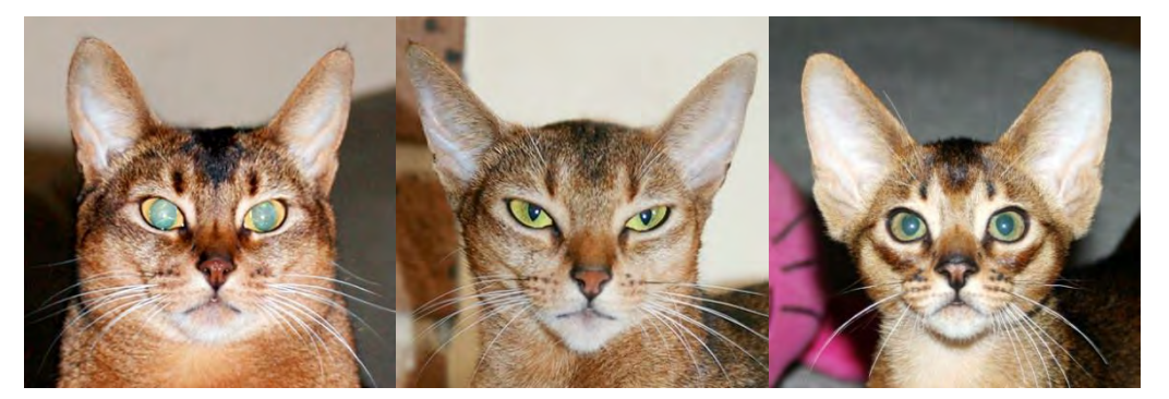
Left: Photograph 3 – smaller, narrow ears that are too high. Middle: Photograph 4 – long, narrow ears that are not broad enough at the base. Right: Photograph 5 – a kitten with narrow width but good-sized ears and cupping.

The use of the words 'relatively large' and 'moderately pointed' infers that the ears should be fairly large in relation to something, presumably the face, and shouldn't end in a point but be slightly rounded at the top. The terms 'broad and cupped at the base' mean that the ears shouldn't be narrow and need to have a wide base that curves around the edge of the head.