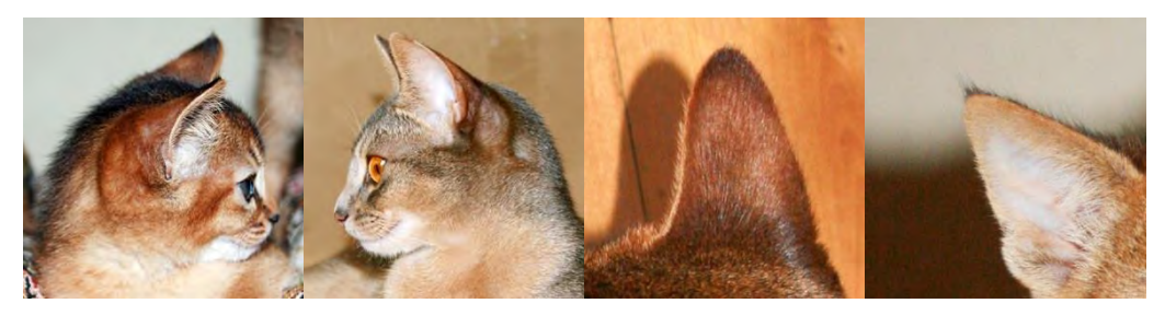
Left: Photograph 6 – kitten ears tilted forward to give the impression of alertness. Middle left: Photograph 7 – cat ears tilted forward. Middle right: Photograph 8 – Fur covering the ears with a thumbprint pattern. Right: Photograph 9 – very small tufts of fur on the end of the ear.

The ears help to give the Abyssinian cat its alert and expressive look, so when viewing them from the side, the ears need to be tilted forward to give the impression they are listening. The ears should have fur on them culminating in tufts on the ear tips. Ear tufts seem to be few and far between on the Abyssinians in Australia although some of the Somalis have retained them.