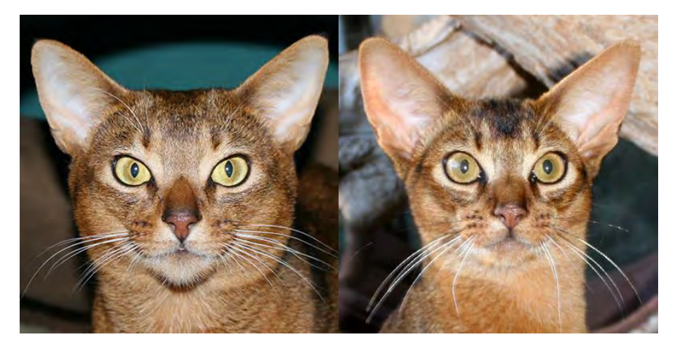
Left: Photograph 1 – Ears set wide apart and are moderately pointed on an adult male. Right: Photograph 2 – Good cupping and ear placement on an older kitten.

The use of the words 'relatively large' and 'moderately pointed' infers that the ears should be fairly large in relation to something, presumably the face, and shouldn't end in a point but be slightly rounded at the top. The terms 'broad and cupped at the base' mean that the ears shouldn't be narrow and need to have a wide base that curves around the edge of the head.